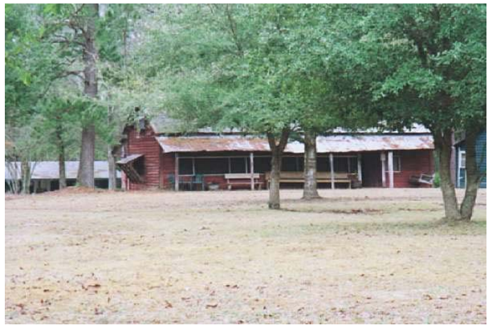
The Accommodations... (not as)... RUSTIC!!!