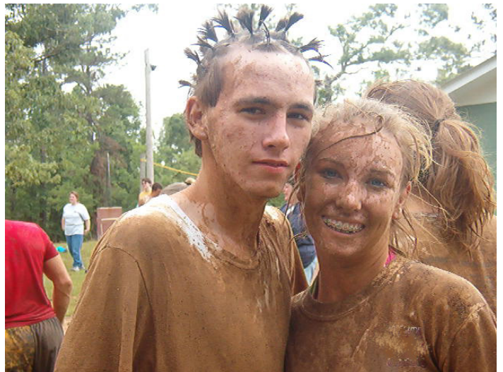
The Mud... (optional, of course)

..... IT'S ALL HAPPENING AGAIN, AND WE WANT YOU TO MAKE PLANS TO JOIN US! 27, 28, 29 MARCH 2009!